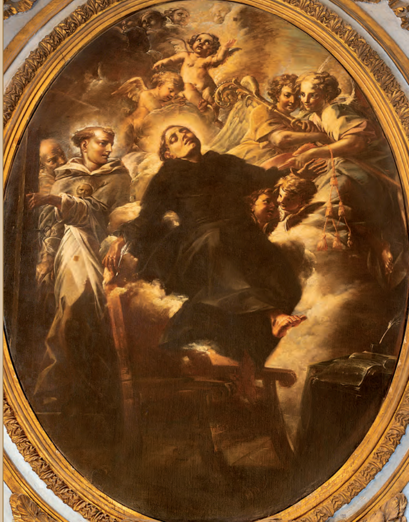
Biagio Puccini, Saint Bonaventure in Ecstasy (1708). Rome, Church of San Paolo alla Regola

posed at the end of the famous pamphlet, Itinerarium mentis in Deum : “If you ask how these things come about, you ask for grace, not instruction, not understanding ... not light, but the fire that sets us completely aflame and brings us to God” ( Itinerarium VII 6).